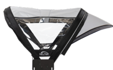
Canopy + Cap