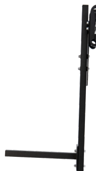
Square tube attachment