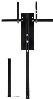
Seat square tube fixation