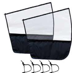
Side panels with armrest fixations