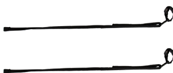
2 front rigid straps to be fixed on the frame to maintain the canopy vertically