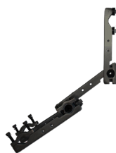
Seat tube armature fixation