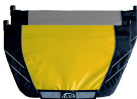
Yellow or grey storage bag