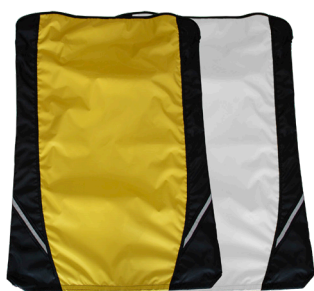
Yellow or grey canopy