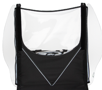
Basket consisting of a tube structure covered with a waterproof fabric and a transparent film + reflectors