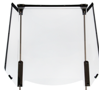
Windscreen hold by 2 stainless tubes