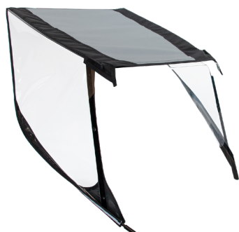
Canopy integrating side panels and tubes for their holding